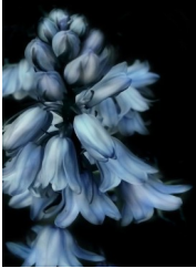
Dorothy Combs September 9, 1931 ~ March 26, 2020