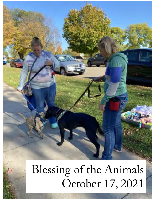
Blessing of the Animals October 17, 2021